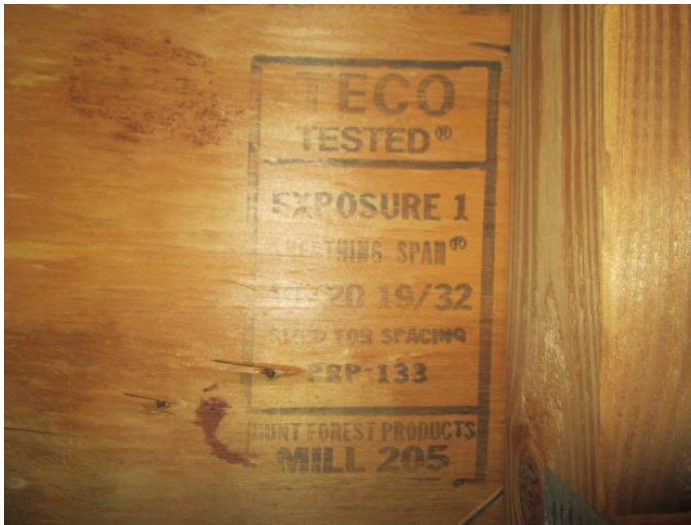
Roof Deck Material