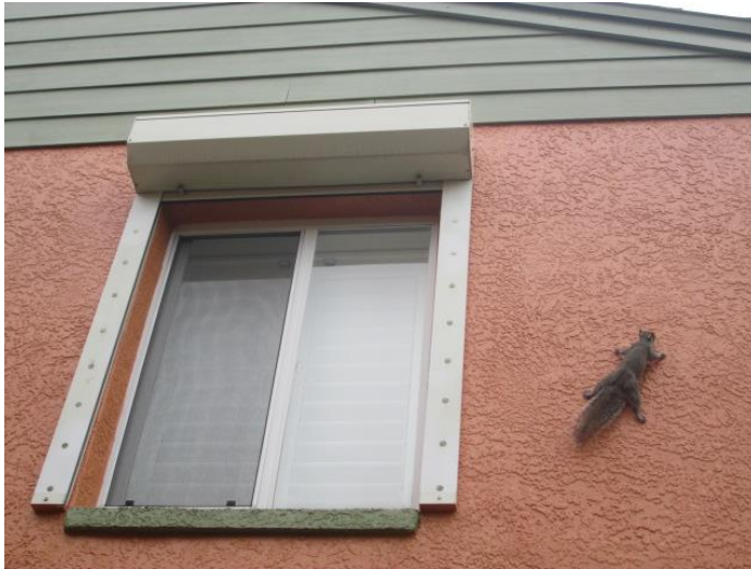
Some Opening Protection